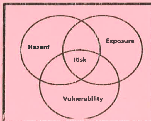
Figure 1: Risk depends on hazards, vulnerability and exposure